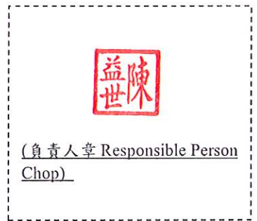
(負責人章 Responsible Person Chop)

立書人或原廠料號 Declarant or Manufacturer Part Number : _____